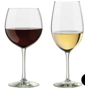
Libbey Vineyard Assorted Clear Wine Glasses, Set of 12