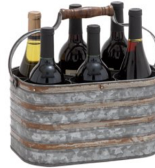
Rustic Metal Galvanize Six Bottle Holder